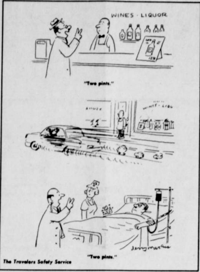
A high percentage of those killed in motor vehicle accidents had been drinking.