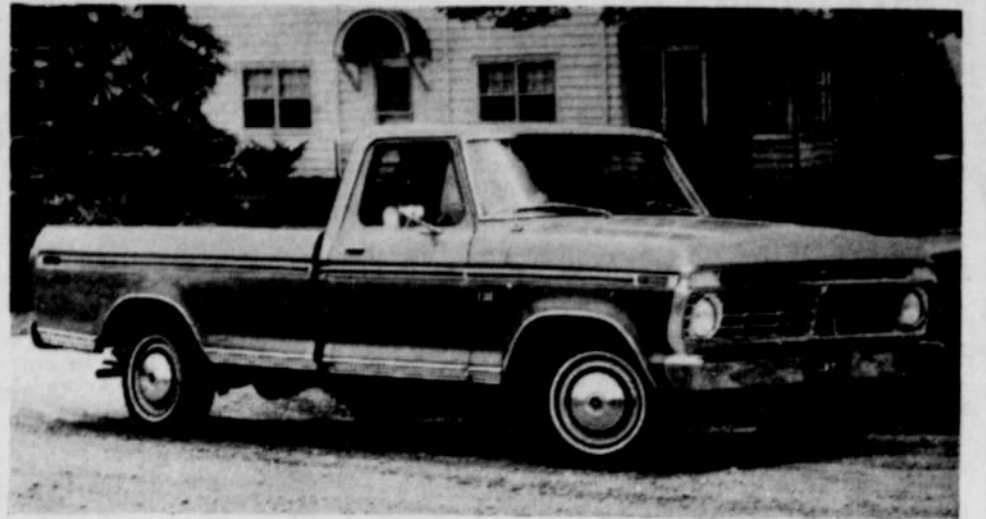
Ford Division's new F-Series pickup trucks, including this F-100 Ranger XLT, feature the most extensive changes in six years. The F-100/250/350 light trucks include an all-new cab, new interiors, new exterior sheet metal, longer wheelbases and wider tracks. Cab length is increased two inches, permitting more leg room and a roomy storage area behind the seat in most models. New features include front disc brakes on all two-wheel-drive models, double wall construction of the cargo box and optional power steering and automatic transmission in four-wheel-drive models.