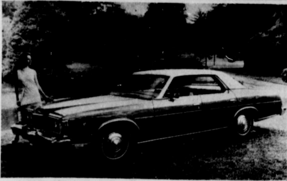
Most changed Ford Division car for 1973 is the full-sized Ford. Shown here is the LTD four-door hardtop. All-new sheet metal below the window line and a new segmented grille give the 1973 Ford a more formal look. All 1973 Fords have a new impact-absorbing bumper system, although the overall length of the car is increased only about one inch. Power front disc brakes, power steering, SelectShift Cruise-O-Matic transmission and a 351-2V eight-cylinder engine are standard in all new Fords.