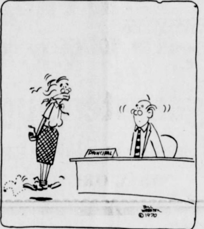
"Hught! --- Humng! --- Aaught!"