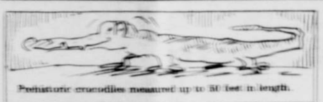
Prehistoric crocodiles measured up to 30 feet in length.