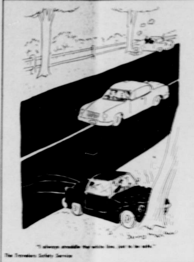
The Television Series Service

THE LORD'S PRAYER has 36 words. Lincoln's Gettysburg Address has 266 words. The Ten Commandments have 297. The Declaration of Independence has 510. A recent government order setting the price of cabbage has 26,311 words. (Hilinda Jellison)