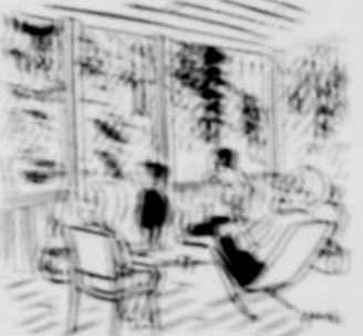
"What beats me is why I look forward to these weeks all year long!"