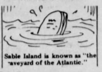
Sable Island is known as "the graveyard of the Atlantic."

A PHYSICIAN and a young man met at a party. "I want to thank you, Doctor, for the benefit I have gained from your treatment." The physician looked at him blankly. "But I don't think you're a patient of mine." "No, I'm not," came the reply. "But my uncle was, and I'm his heir." (Yours in Rotary, Margao, India)