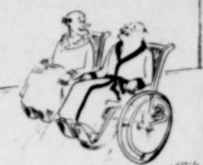
"I was darned lucky to get my attack on the day I was eligible for retirement."