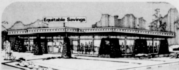
1094 S.W. 4th Avenue in Ontario