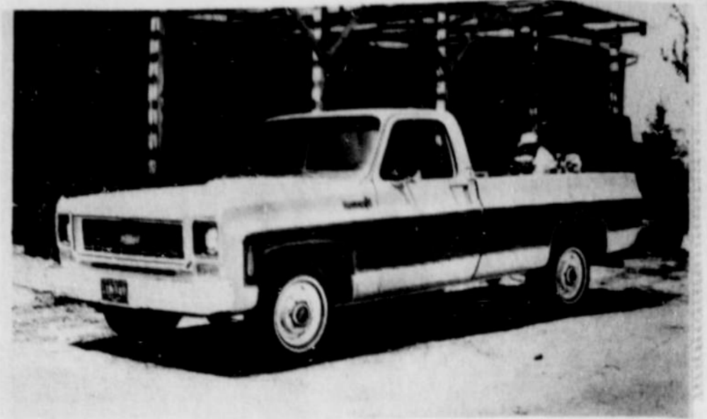
1973 CHEVROLET FLEETSIDE CHEYENNE SUPER PICKUP - Completely restyled and with extensive chassis redesign, the 1973 Chevrolet pickup line features many improvements in appearance, durability, and comfort for both commercial and personal transportation. Highlights are curved side windows, powered cab ventilation, new leaf spring rear suspension, increased cooling capacity, a larger available engine, outside fender skirts, wheel covers, and highly styled interiors.

Fly ash, a residue produced by the burning of finely pulverized coal in large power plants, is now collected by means of electrostatic precipitators, and is being used as a cement extender in ready mix-concrete and concrete block. A year-long program involving the removal, classification and sale by AMAX Fly Ash Corporation, Atlanta, Ga., from the Georgia Power Company has demonstrated how fly ash can be profitably utilized. During the first year more than 60,000 tons of fly ash were recovered and shipped. According to the AMAX spokesman the addition of fly ash "produces a stronger and more durable and impermeable concrete product. Further it reduces raw material costs."