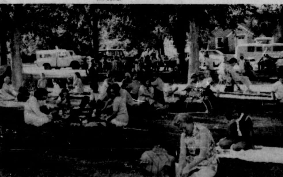
AREA RESIDENTS joined with visiting Rock Hounds Thursday evening to enjoy the barbecue in South City Park. The large crowd