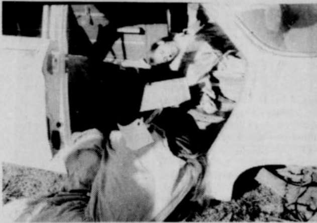
This sequence of pictures was taken at the disaster drill held early last week, with firemen, ambulance crews, city police and medical personnel participating.