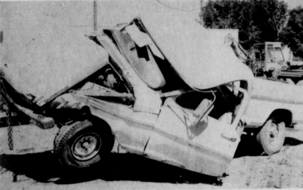
This is all that remains of a pick-up truck that was struck by a train about 4 a.m. last Thursday.