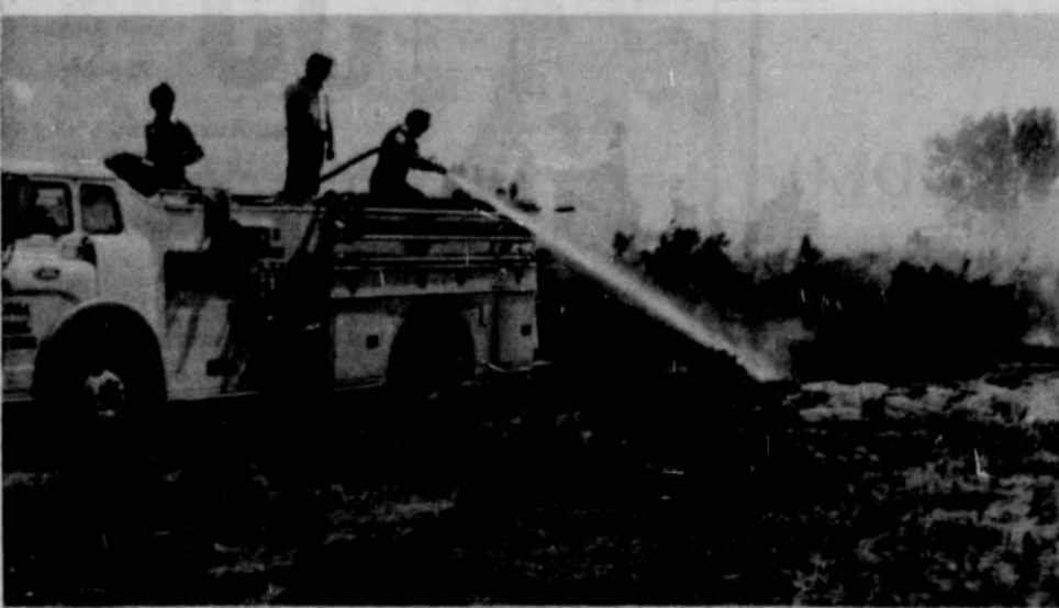
Nyssa volunteer firemen are shown fighting a blaze last Thursday afternoon on property south of Thompson Avenue. Nyssa Co-op fertilizer plant can be seen through the smoke in the background.

The blaze reportedly started when sparks from a small trash fire jumped into the dry grass and burned over several acres before being extinguished.