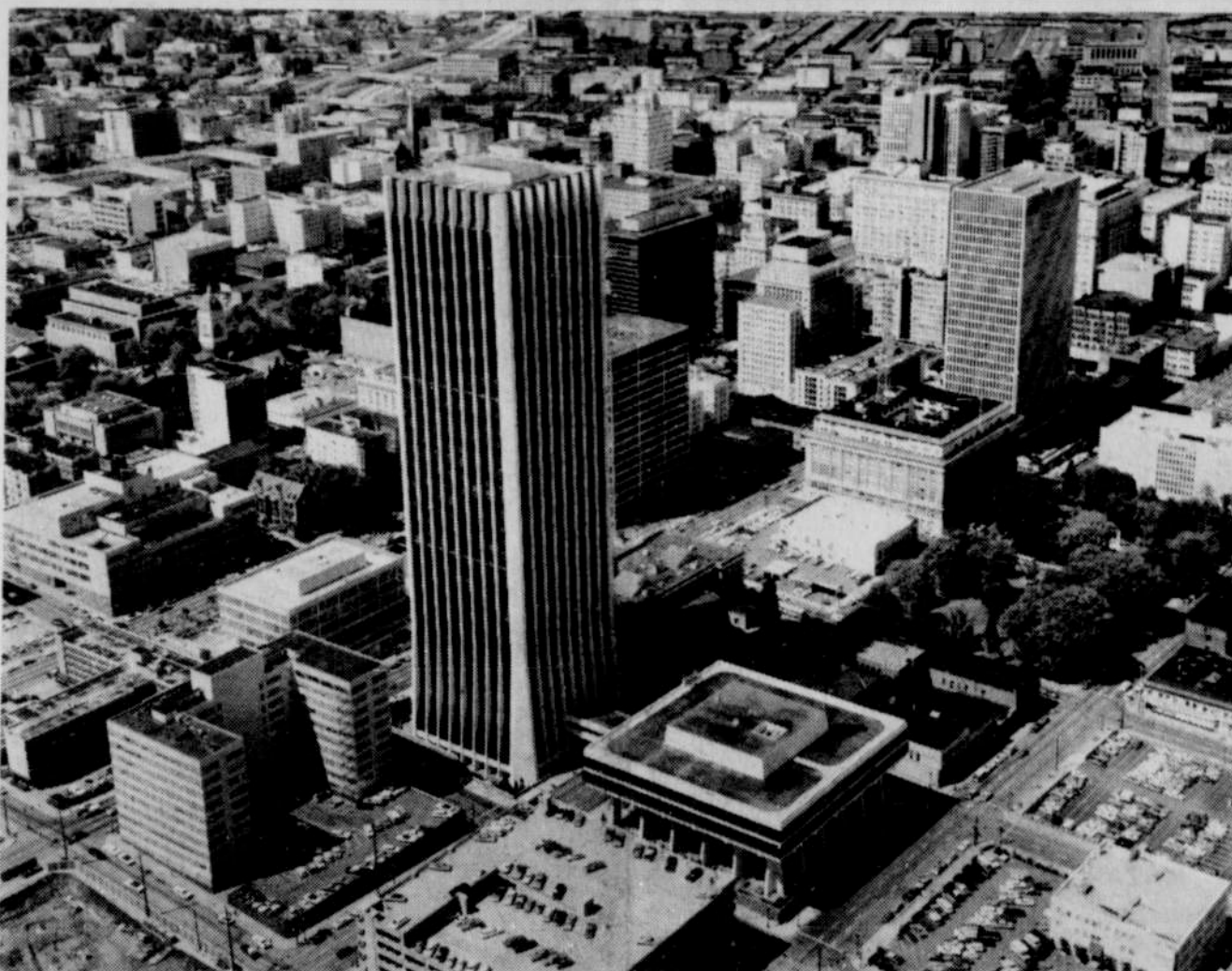
Imposing site on the Portland skyline is the new First National Center. The two-block statewide headquarters for First National Bank of Oregon was dedicated May 25. The two-building complex is bounded by SW 3rd and 5th Avenues, Jefferson and Columbia Streets, and borders the expanding urban renewal area in downtown Portland. Construction began in 1969.