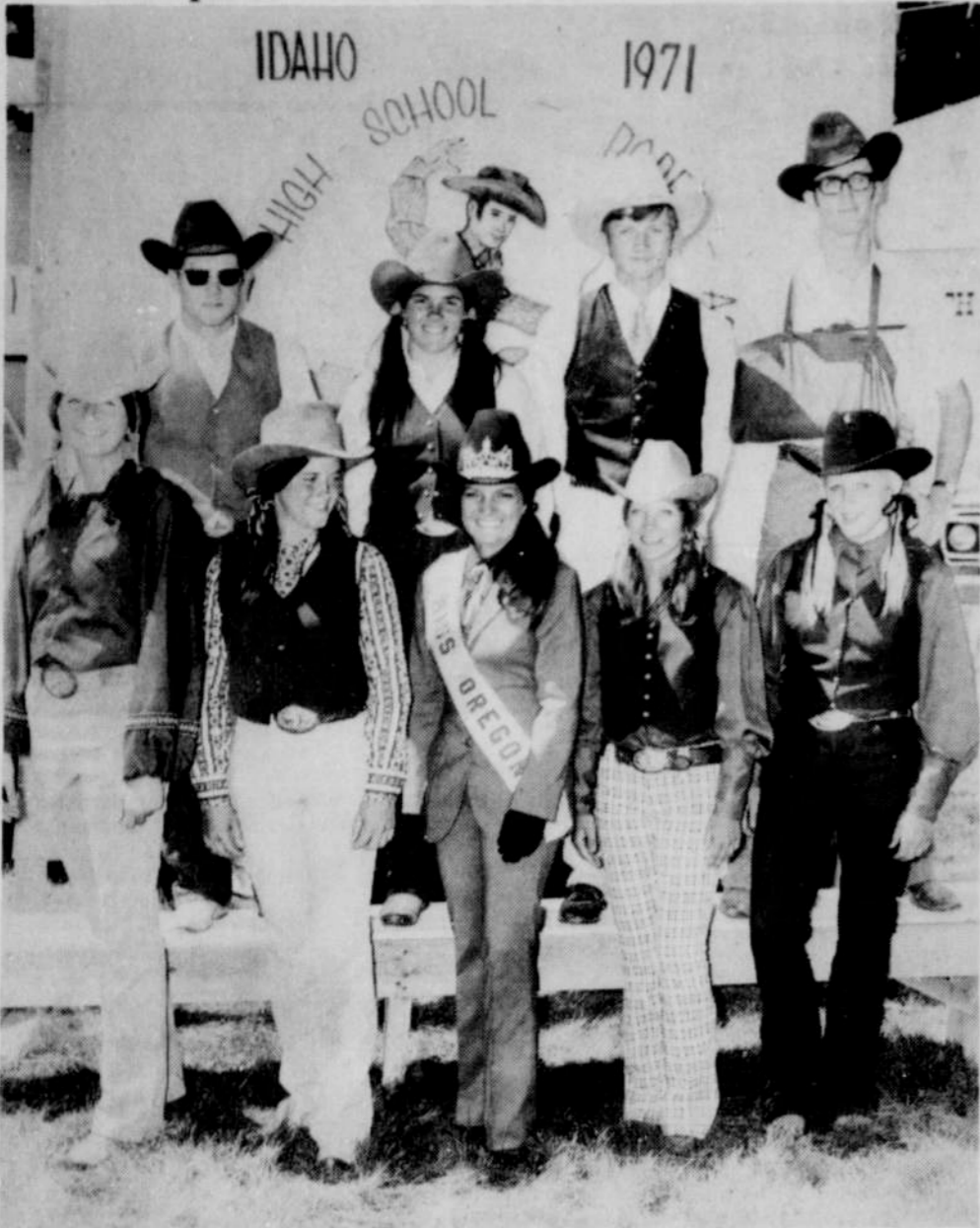
Members of the Oregon High School Rodeo Team who competed at the National High School Rodeo Championship Finals for 1971 and brought home top honors. Several of these young people may be seen in action at Vale this weekend when 182 youth from throughout Oregon will compete in an Oregon High School Rodeo.