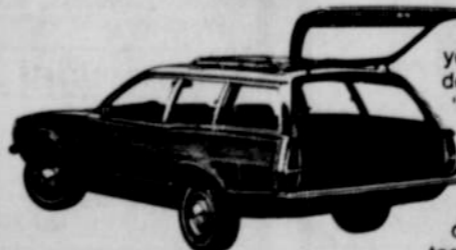
Ford Pinto Wagon with Squire Option

Ford Team 1¢ wagon sale: How's that for price? Built to give youngsters great fun and good service. It has a natural hardwood body, detachable stake frame, "mag" wheels, semi-pneumatic rubber tires, "easy-turn" steering. All for just a penny when you buy one of Ford's best-selling wagons. Like luxurious, quiet-riding Country Squire. Or all-new Torino that comes with 3-way doorgate, front disc brakes, standard!