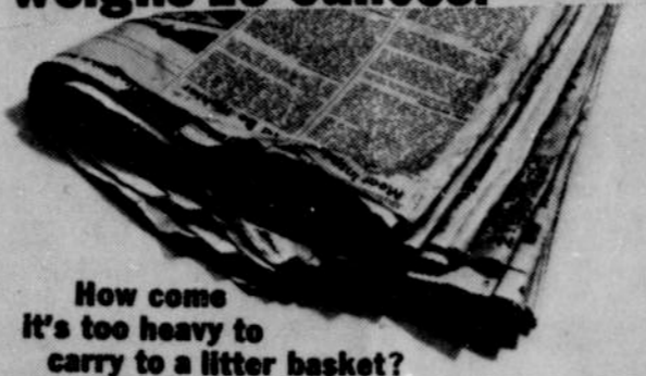
How come it's too heavy to carry to a litter basket?