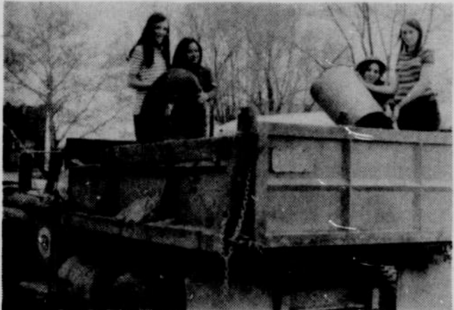
Nyssa High School students filled two dump trucks with debris as they covered the city and school yards picking up trash in observance of "Earth Day" last Friday.