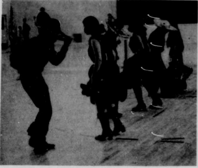
Shown are six of the Mexican-American students from Hillsboro doing the Mexican Hat Dance as they entertained Nyssa Junior High School Students Friday.