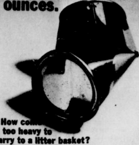
How come it's too heavy to carry to a litter basket?