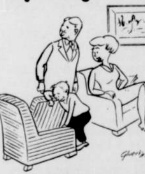
"He's working for a little loose change for camp."