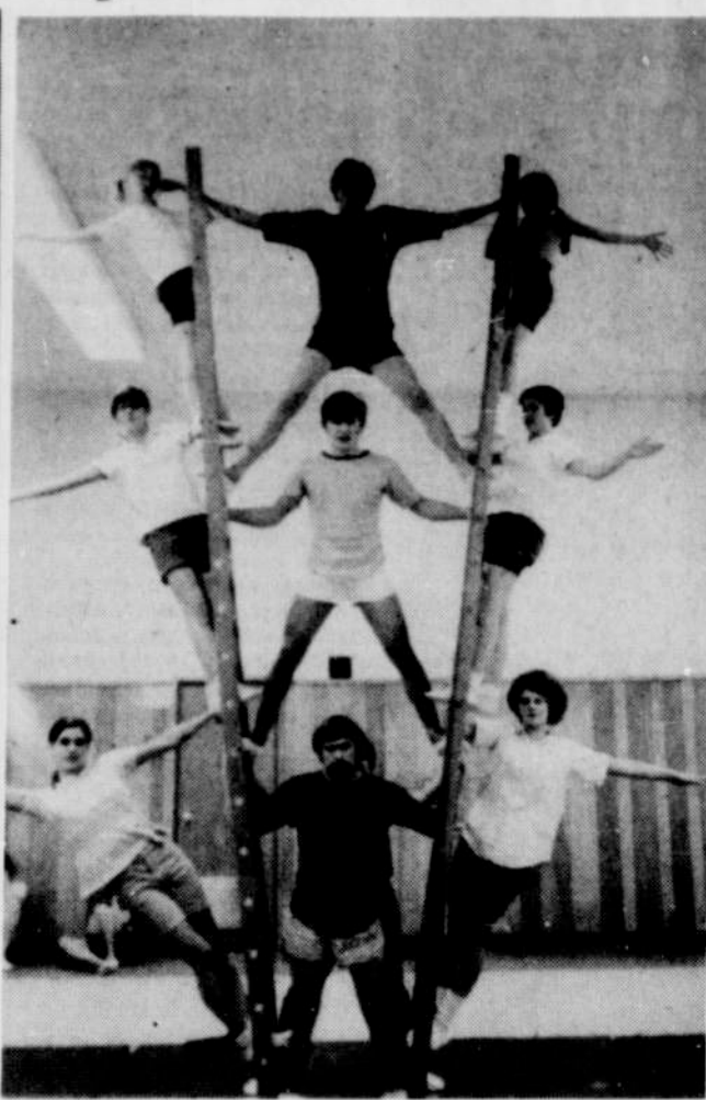
Shown are some action shots of the Adrian High School Tumbling Team. On the upper left is a girl shown doing a headstand and spring over the 5 foot 6 inch high vault box. In the top right picture is a group in the ladder formation position. At the right is a girl doing a headstand on the Balance Beam. The Balance Beam is four inches wide, 16 foot long and four feet high.