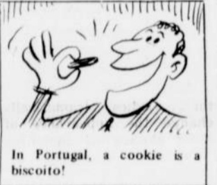
In Portugal, a cookie is a biscoito!

The agency can help the consumer only if he has a justifiable complaint and can provide adequate information about the transaction. It is the responsibility of the consumer to keep important papers and other records in case he needs them to support a complaint.