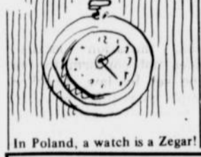
In Poland, a watch is a zegar!