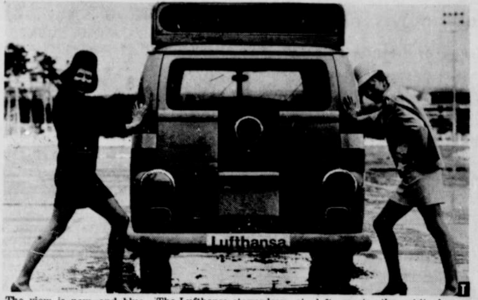
The view is new and blue. The Lufthansa stewardess at left, sports the airline's new uniform. At right, the same uniform in yellow. They're enough to give any pilot's spirit a lift.

Altitude-trained stewardesses at Lufthansa German Airlines have been sporting a completely redesigned miniwardrobe since April in celebration of the airline's first Boeing 747 jet flights.