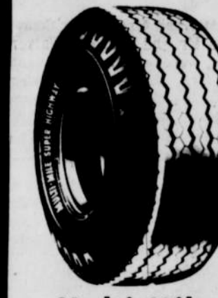
Multi-Mile SUPER HIGHWAY