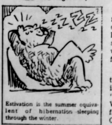
Estivation is the summer equivalent of hibernation - sleeping through the winter.