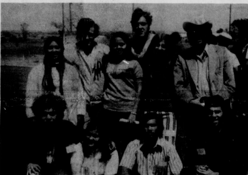
CENTRAL - SOUTH AMERICA