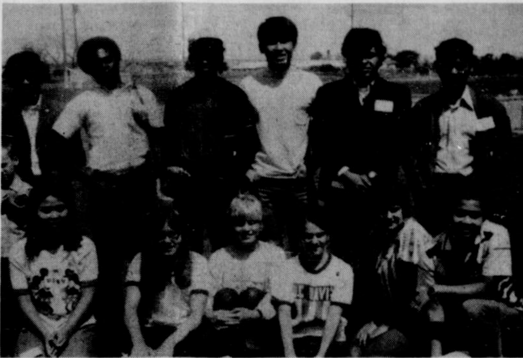
ASIA AND AFRICA

During their few days in Nyssa they saw cattle operations on Albertson Island, visited the Amalgamated Sugar Factory, picnicked at Owyhee Lake and toured the dam, and enjoyed swimming parties and mixers with their group and Nyssa students.