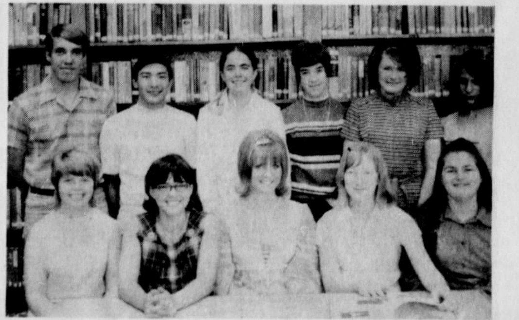
These eleven sophomores were initiated into the Adrian High School Chapter of the National Honor Society in impressive rites Monday evening in the school cafeteria with parents present for the ceremony.