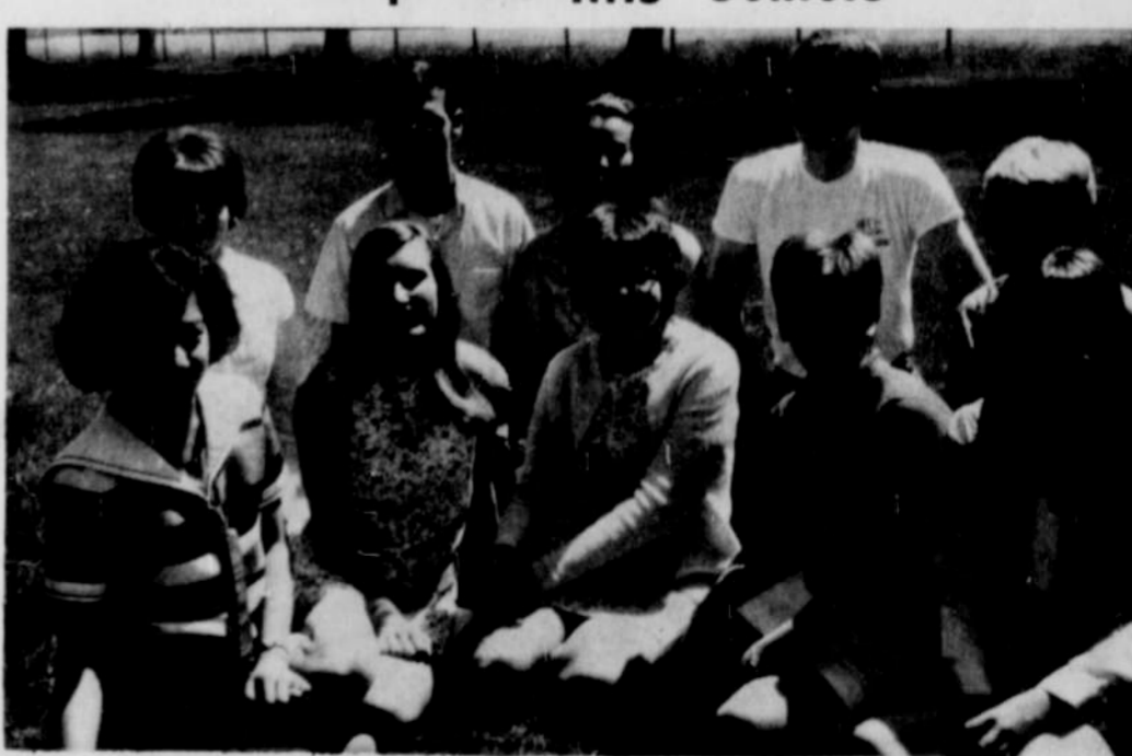
Displaying their photogenic smiles for the last picture of the year are these Top Ten Students from the class of 70. After four hard years of praying and thinking these students have emerged as number 1 students.