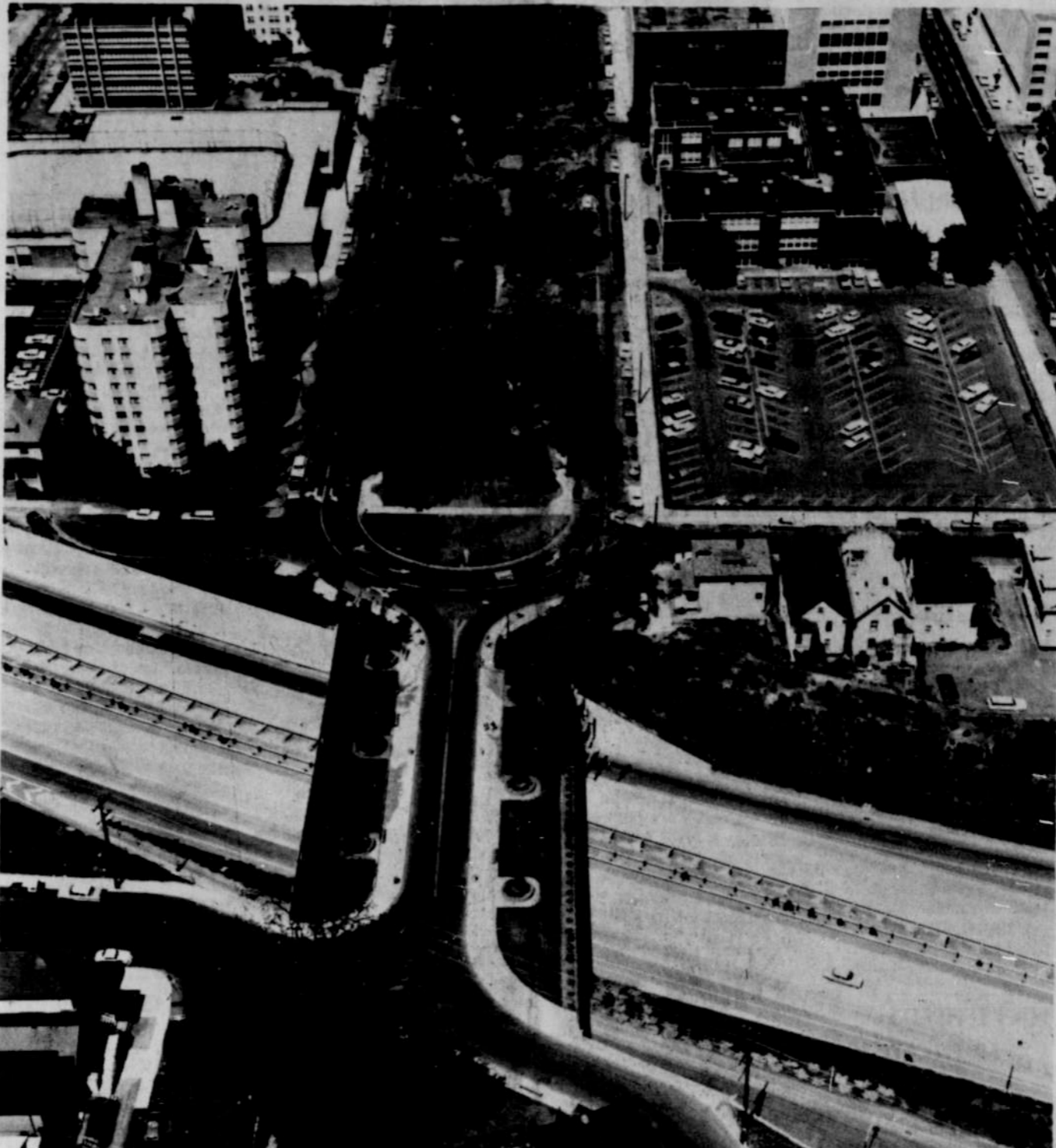
Pictured above is the Stadium Freeway in Portland, with Portland State University in the background. In the upper right corner is Broadway, with the Park Block in the center. Continuation of the park across the new freeway was cause for an honorable mention award in the national highway beautification contest.

A U. S. Department of Transportation certificate will be presented to the Oregon department.