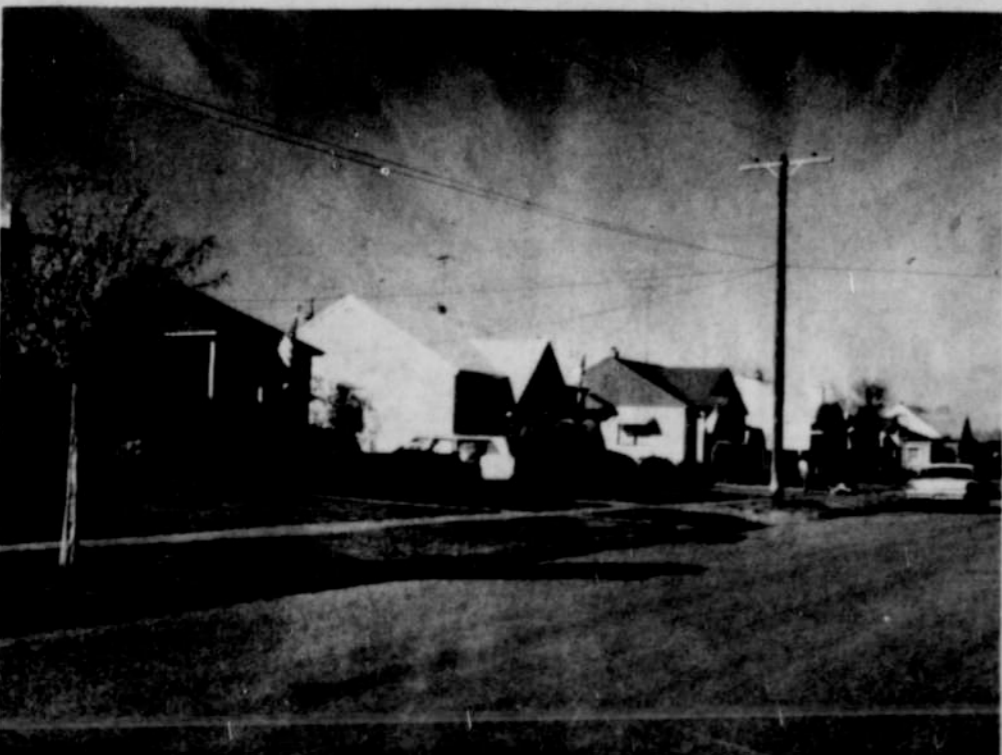
THIS PICTURE TAKEN ON SOUTH seventh street shows five houses in a row displaying the American Flag on Veteran's Day. Hundreds of flags all over Nyssa were flown honoring those who have served their country in the Armed Forces. To dispel any doubts that this is truly God's country, note the boy mowing the lawn on November 11!