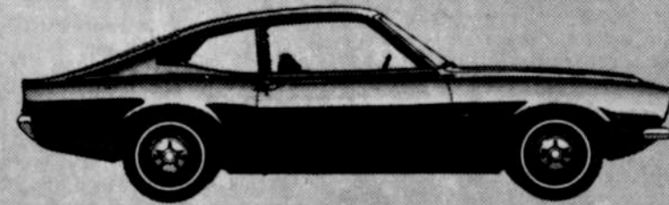
NEW MAVERICK Held the price line in '70. Simple to drive, to park, to service and to own.

Only your Ford Dealer has the best-selling economy car, low-priced luxury car and sports compact