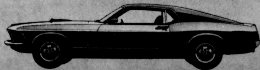
NEW MUSTANG Run with No. 1! Six fresh models from low-priced hardtops to hot Boss 302's.

See the man with the most to show...your Oregon Ford Dealer