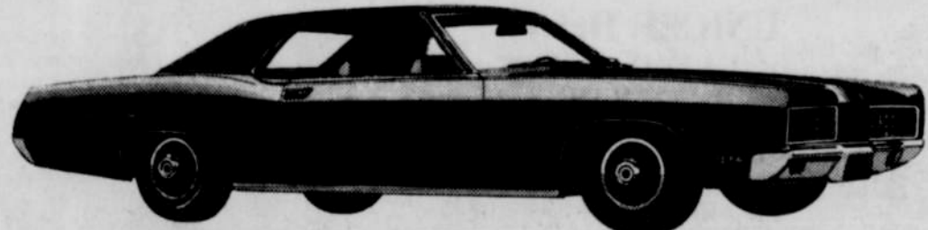
NEW LTD by FORD Quiet, luxurious. New computer-designed frame and "forgiving" suspension smooth ride.