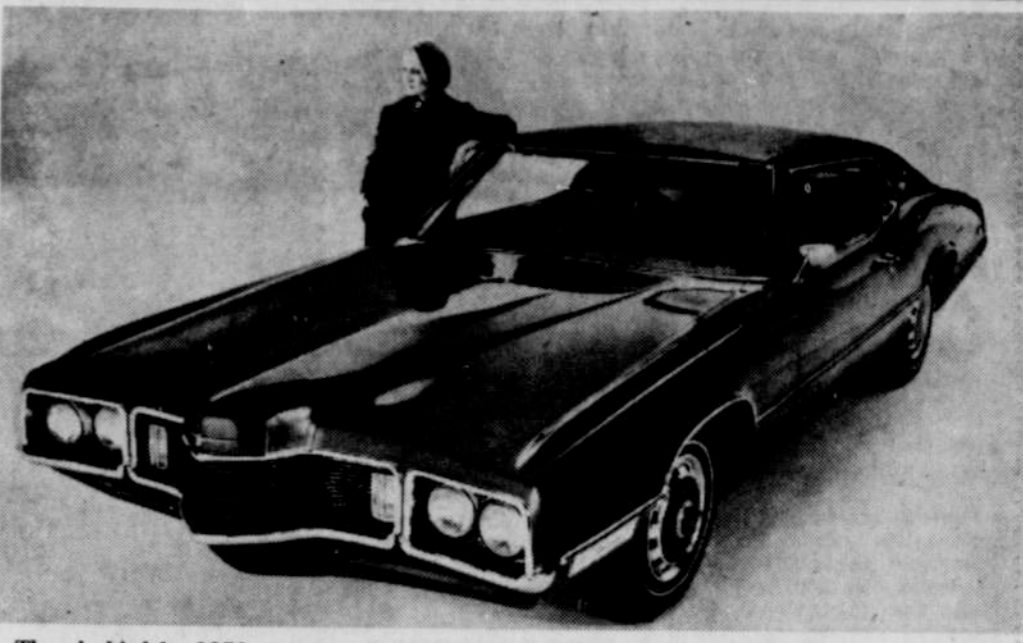
Thunderbird for 1970 presents a bold new look, highlighted by a dramatic front end design. All models feature a longer, lower hood and three section extruded aluminum grille for a more formal appearance. Included in the Special Brougham option group, shown here on the Thunderbird two-door Landau, are such features as grille lamps, color-keyed wheel covers and high-back bucket seats. Thunderbirds also have hidden windshield wipers and hidden radio antennas to emphasize the clean design.