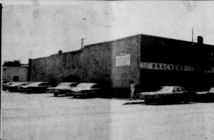
PARK FREE - FRONT, SIDE OR REAR!

LADIES' SHIRT SHIFT DRESSES $3.49 Solid Colors and Plaids Machine Washable Sizes - 8 to 18