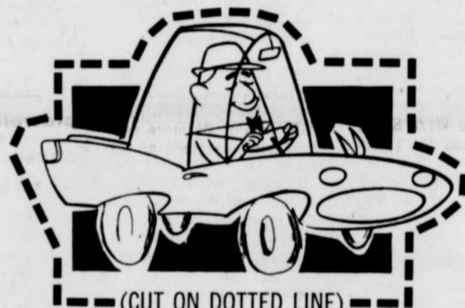
(CUT ON DOTTED LINE)