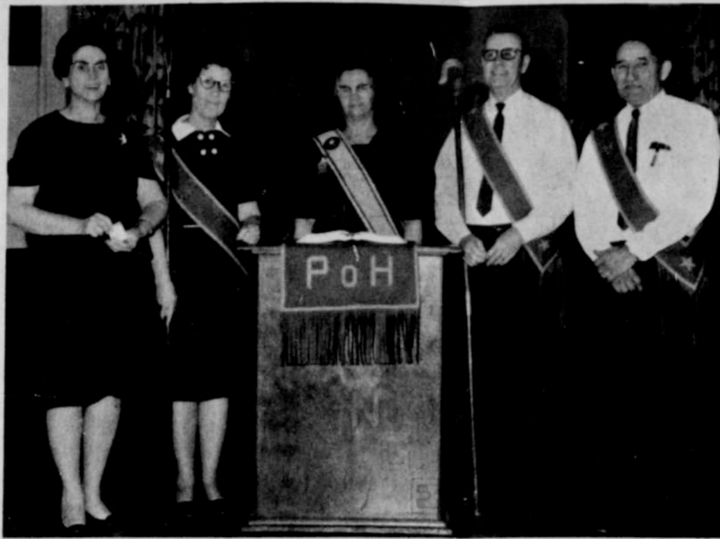
PINS REPRESENTING 25 YEAR OF GRANGE membership were presented at the Feb. 6 Oregon Trail Grange meeting to (l to r)