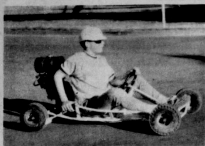
THIS LAD MAY NOT HAVE BEEN THE tallest or largest in the Nyssa rodeo parade but he was among the 'speediest' ones. In fact, the Journal photographer tried to take a shot of him and another youth driving a similar 'four-wheeler', but found that it just couldn't be done. The unidentified lads were stationed to 'bring up the rear' of the parade and it supposed that their 'speed-demon' noise might have frightened some of the numerous horses in the line-up.