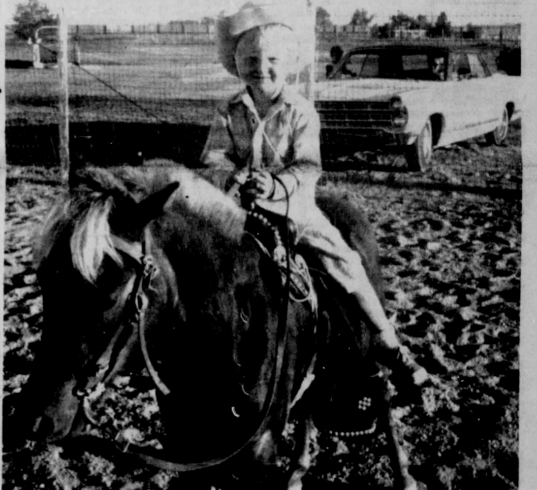
HERE IS THE SHETLAND PONY to be awarded to a lucky number holder among 12-year-old, or younger, attendants at the Friday evening performance of the Jaycee sponsored Nyssa