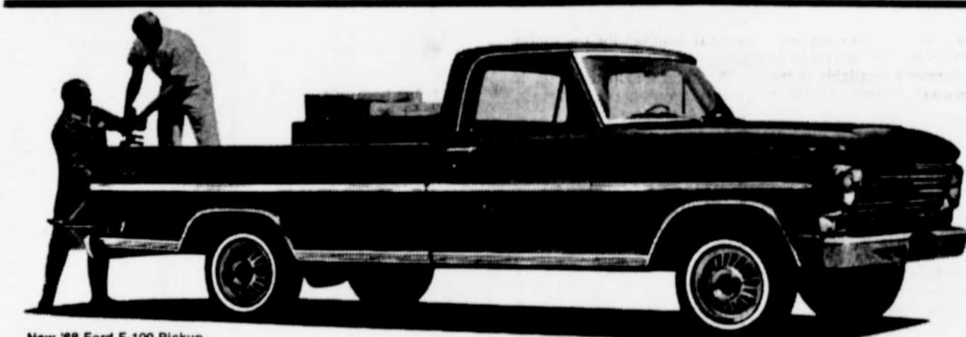
New '68 Ford F-100 Pickup