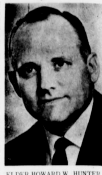
ELDER HOWARD W. HUNTER