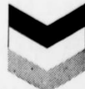
The Chevron - Sign of excellence

Standard Oil is trying to help young people discover more about themselves ... and the world they live in.