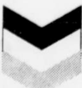
The Chevron— Sign of excellence

Standard Oil is trying to help young people discover more about themselves... and the world they live in.