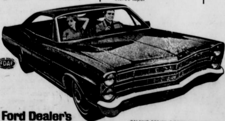
GALAXIE 500XL 2 DOOR HARDTOP