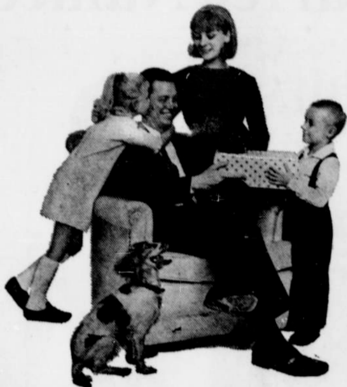
(See Editorial in Left-Hand Column)