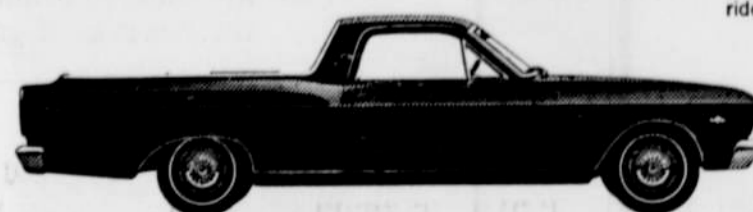
Ranchero—sleek-lined, roomy, spirited... low priced to boot. Lots of luxury offered, too. Six or two big V-8's. Automatic, 3- or 4-speed stick shift.