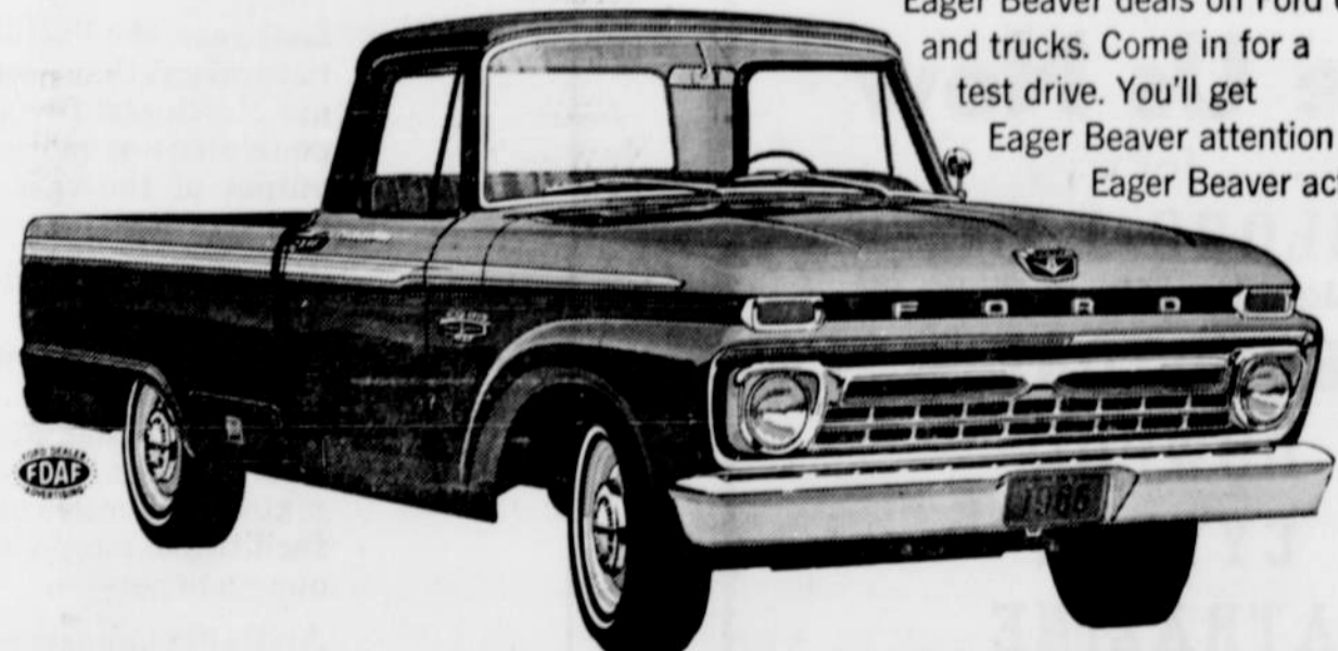
Ford F-100—famous Twin-I-Beam front suspension ride. Choice of two Sixes or a big V-8.