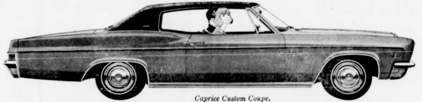
Caprice Custom Coupe.