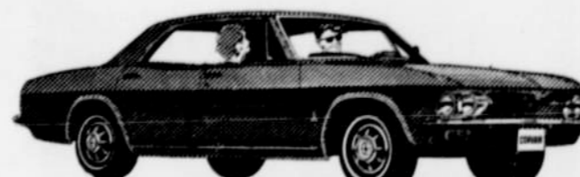
Corvair Monza Sport Sedan.