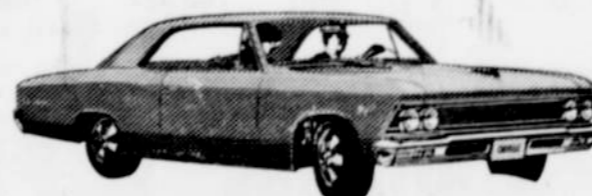
Chevelle SS 396.