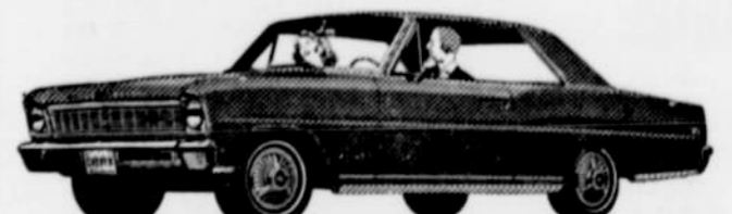
Chevy II Nova SS Coupe.

Starting now—Double Dividend Days at your Chevrolet dealer's! (Just the car you want—just the buy you want.)