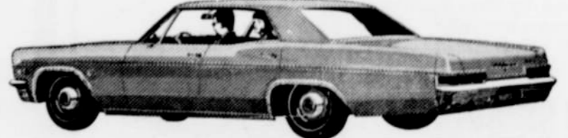
Impala Sport Sedan.