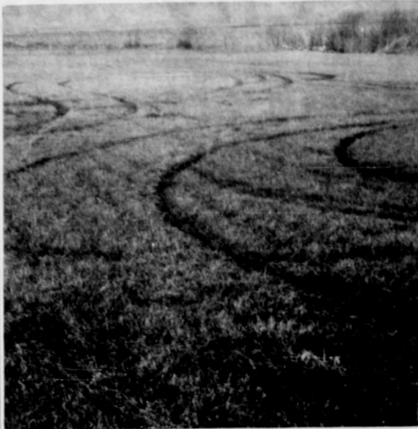
HERE'S A NEW TYPE OF VANDALISM for our area. This newly seeded section of the Nyssa cemetery was invaded by auto Saturday night, cutting ruts (as much as four inches deep). At press time there were no leads as to the culprits, but it is hoped they can be found and made to physically repair what can be done by hand and forced to pay for the rest of the damage. The new plot was soon to be opened and put into use for the public. It might be needed for some close relative of those responsible for marring the landscape.

The enormous lag keeps our food products in surplus and makes for starving people abroad.