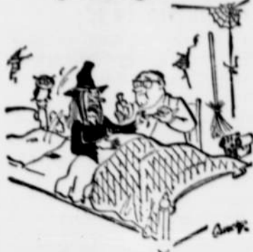
"Ugh! What kind of witches brew is that!?"