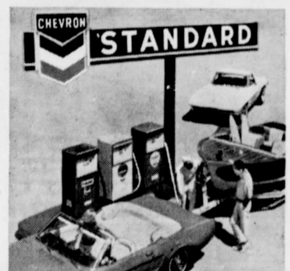
The research skills which created the Isomax Process go into the development of all our products at the Sign of the Chevron... to take better care of your car. Your boat, too!

The Isomax Process means better gasolines for today's cars, and for cars now being designed for the future... another proud research "first" by Standard Oil - for you.