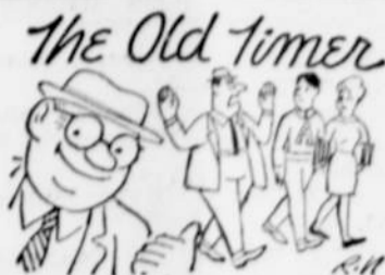
"Middle age is when a broad mind and a narrow waist change places."