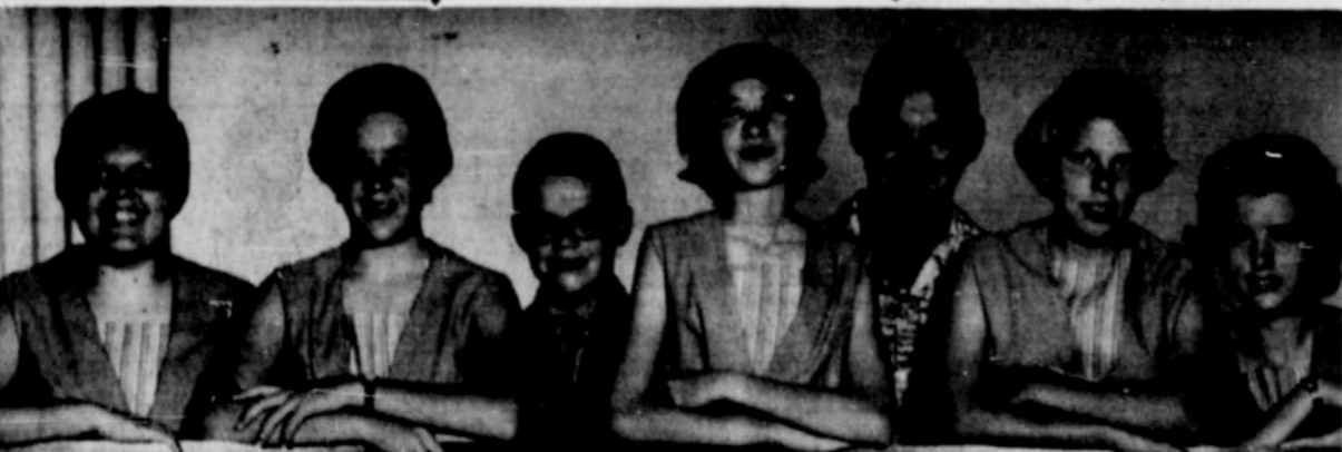
GIRL SCOUTS OF USA TROOP 99 NYSSA, OREGON