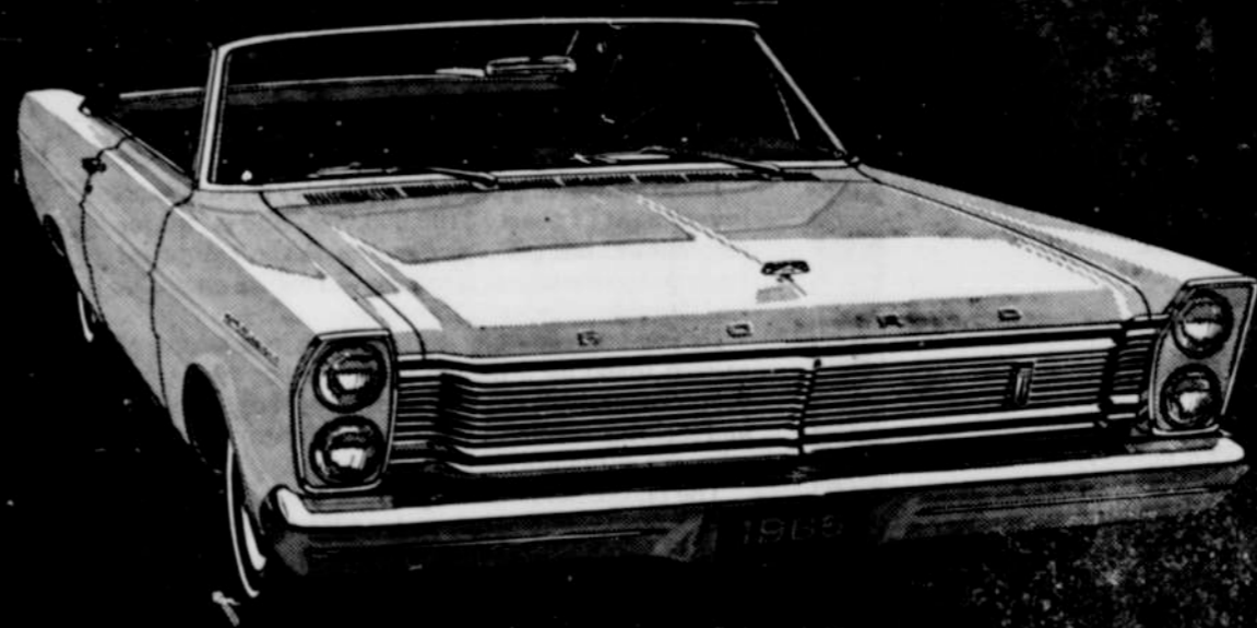
Galaxie 500 Hardtop with vinyl-covered roof