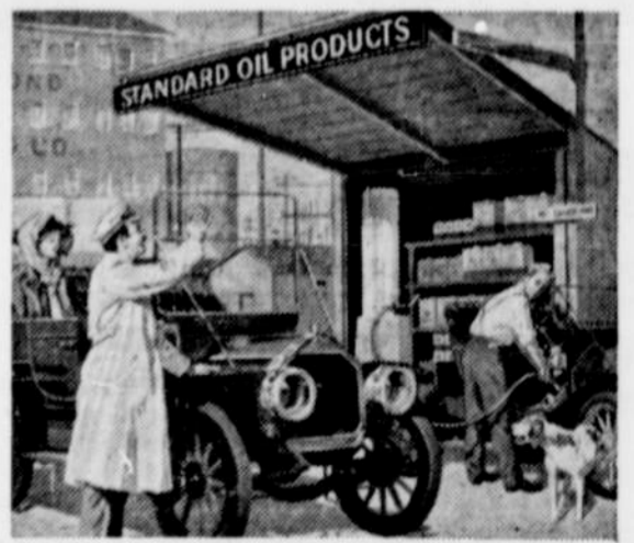
Standard opened another frontier, America's first service station, in Seattle, in 1907. From this proud tradition, the man at the Sign of the Chevron serves you with today's highest quality S.O. Products.

Standard Oil men are more than oil-hunters. They are goodwill ambassadors. They take American friendship with them . . . everywhere they go!