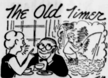
"Women like a strong silent man because they think he is listening."