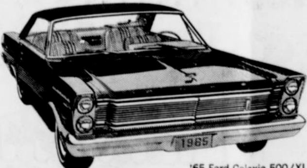
*'65 Ford Galaxie 500/XL

Some of you skeptics—you Unkiddables—laughed in disbelief when we said Ford rides quieter than Rolls-Royce. Well, we've got to prove Ford quietness to you—by keeping our mouths shut—and letting our '65 Fords speak for themselves. Skeptical? Come on in! Hear for yourself how quiet a car can be!