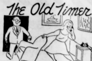
The Old Timer "When a man answers the phone he reaches for a pencil; a woman reaches for a chair."