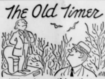
"There's one thing that can be said in favor of statues for politicians—they keep their mouths shut."

Several ladies from the Nyssa-Adrian area attended the Saturday luncheon.