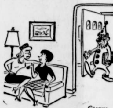
"Wait'll you meet my husband—he's a lovable clown."