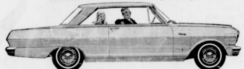
'64 THRIFTY CHEVY II—Nova Sport Coupe