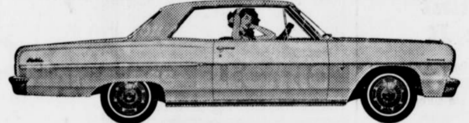
ALL-NEW CHEVELLE—Malibu Sport Coupe