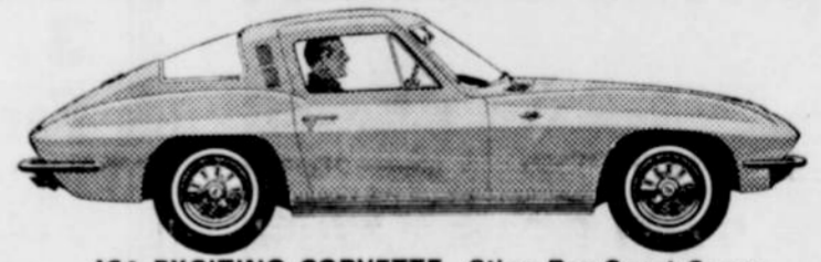
'64 EXCITING CORVETTE—Sting Ray Sport Coupe