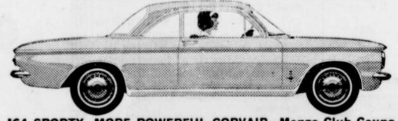
'64 SPORTY, MORE POWERFUL CORVAIR—Monza Club Coupe